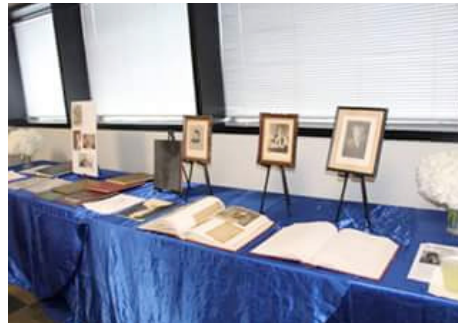
Display at Jubilee

D istrict 9 of the Texas Nurses Association (TNA) in Houston, Texas organized a Jubilee event to recognize the 100th anniversary (1916-2016) of the professional association. The Jubilee planning committee considered it important to honor and research the historical underpinnings of its century of accomplishments. For example, Association activities were described in relation to historical events such as the Great Depression. In addition, effort was made to relate efforts of the Association with current professional goals, such as how nurses are an important presence on hospital boards of directors. A research grant was applied for and received from a local university chapter of the Sigma Theta Tau, providing support for the research.