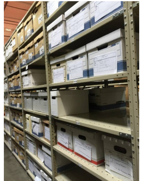
TNA District 9 boxes at the archive

The 100th Anniversary Jubilee Program, held on the founding anniversary date, September 12, 2016, included displays from the archives of the Association, a video of long time members sharing recollections of important District 9 efforts and activities, and a 1 hour continuing nursing education program. The program highlighted significant events in the history of the Association.