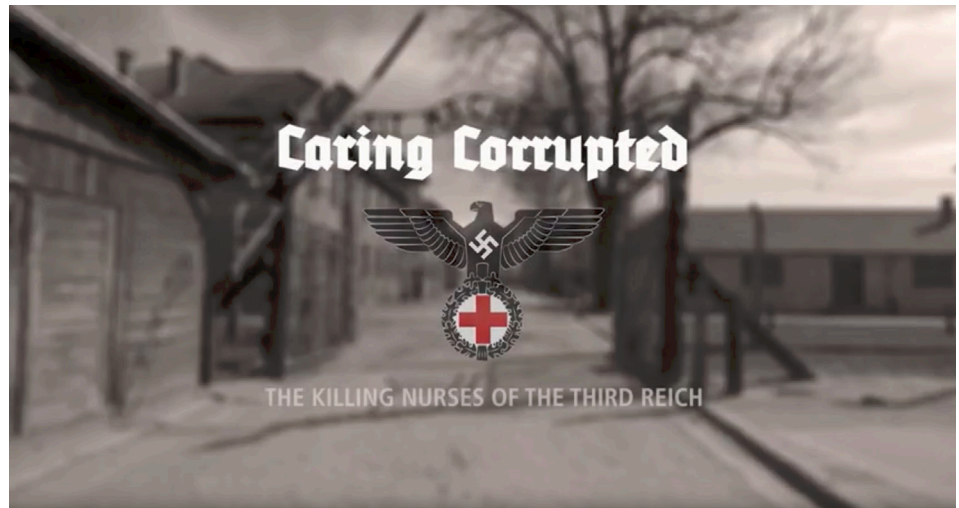
The School of Nursing premiered its 56-minute film January 12th at the Holocaust Museum Houston.

“These Third Reich nurses lost their moral ‘true north’ – and, instead of easing the suffering of vulnerable individuals and defying immoral orders, their ethical compasses were diverted, and they lost their bearings of professional responsibility and